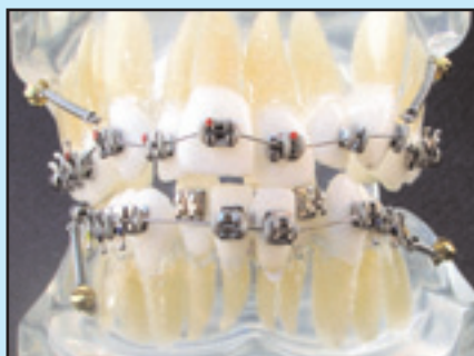
Ortho Implant Model - Anterior View