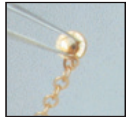
Fine tips securely hold the tiniest attachment