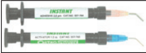
SuperBond Kit Cat. No. 557-754

1 kit - $ 65.00 each 3 kits - $ 60.00 each 5 kits - $ 55.00 each