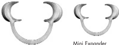
Standard Expander Cat. No. 822-444