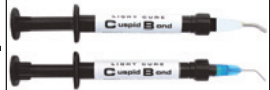
CuspidBond Kit Cat. No. 557-754

1 kit - $ 65.00 each 3 kits - $ 60.00 each 5 kits - $ 55.00 each