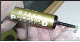
Easy Applicator Syringe

UltraPermaBand 2 x 7 gm Easy Applicator Syringes Cat. No. 557-482 1 to 2 kits - $ 27.00 each 3 to 4 kits - $ 25.00 each 5 plus kits - $ 23.00 each