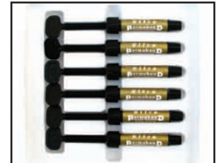
ULTRA PERMBAND OFFICE KIT ORIGINAL SCREW SYRINGES Cat. No. 557-477

1 to 3 kits - $ 65.00 each 4 plus kits - $ 60.00 each