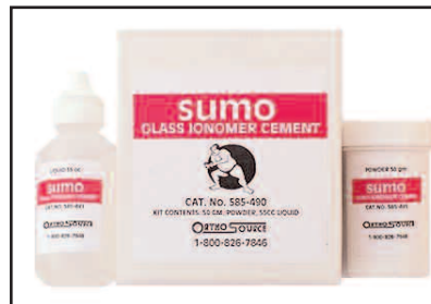
SUMO LARGE 50/55 KIT 585-490

1 to 2 kits - $ 33.00 each 3 to 4 kits - $ 30.00 each 5 plus kits - $ 28.00 each